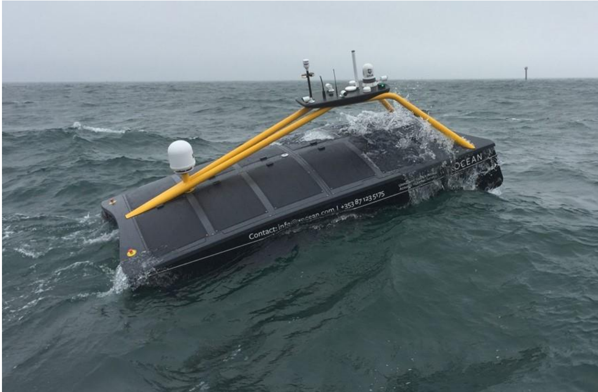
Figure 3: XO-450 USV

The USV sends real time images and situational awareness data over satellite to a team of operators keeping watch and controlling the vessel remotely 24/7.